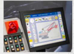
Ergonomic OEM joystick pods