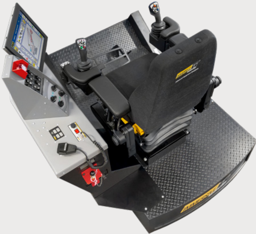
High fidelity LCD operator interface