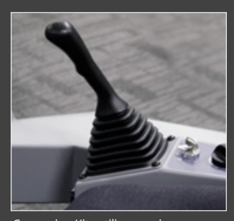
Conversion Kits utilize genuine Komatsu cab controls and instrumentation