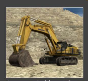
Accurate operational characteristics using technology and proprietary data licensed from Komatsu

With mining equipment becoming increasingly technically sophisticated, the level of information, experience and organizational competencies required to accurately simulate these machines also increases. Through Immersive Technologies' industry experience and exclusive alliance with Komatsu, you can be assured your training solution will be the only accurate and true representation of the real machine available.