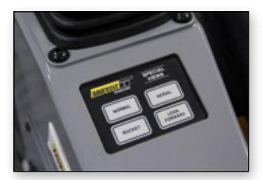
Special View Switches