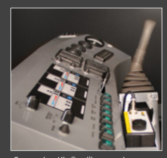
Conversion Kits® utilize genuine Hitachi cab controls and instrumentation