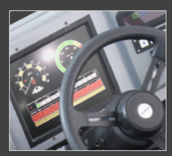
Conversion Kit utilizes genuine Liebherr cab controls and instrumentation