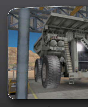
Site Specific Procedu