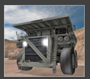
Accurate operational characteristics using technology and proprietary data licensed from Liebberr

Original Equipment Manufacturer and industry endorsed T282B operating procedures are tightly integrated with an extensive learning system within the Advanced Equipment Simulators. This system has been repeatedly demonstrated via evidence collected from within mining operations to provide rapid, correct and effective learning and assessment.