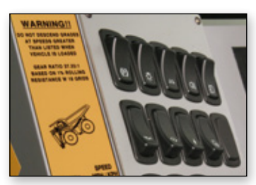
Functional lighting, brake, lube and fault reset switch panel