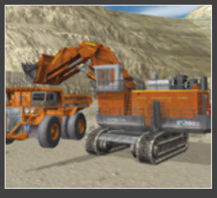
Accurate operational characteristics using technology and proprietary data licensed from Hitachi Construction Machinery

With mining equipment becoming increasingly technically sophisticated, the level of information, experience and organizational competencies required to accurately simulate these machines also increases. Through Immersive Technologies' industry experience and exclusive alliance with HCM, you can be assured your training solution will be the only accurate and true representation of the real machine available.