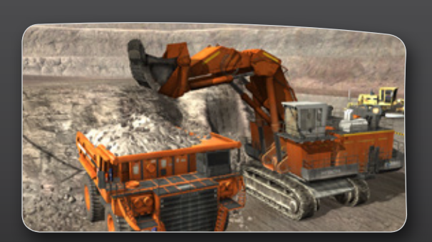
Safe Operating Procedures