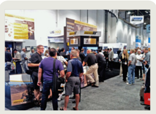
Immersive Technologies' Booth at MINExpo

The crowds told the story of Immersive Technologies' presence at MINExpo International 2012 in Las Vegas. An estimated 58,000 visitors from 36 countries visited the show where key Immersive Technologies