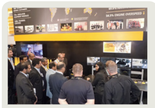
Trainer Productivity Station demonstration during MINExpo

A large Zambian mining operation has wasted no time in taking advantage of this new complete and scalable solution from Immersive Technologies. They were the first to purchase almost all key elements in support of a comprehensive training strategy. This purchase included